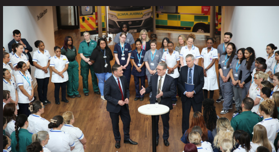
Sir Keir Starmer met with students during the election campaign