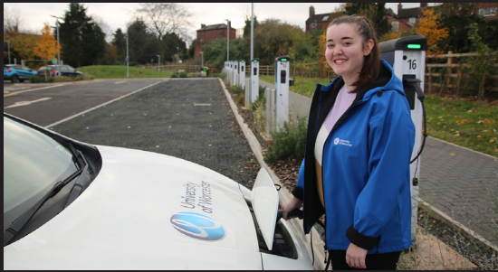
Severn Campus has more than 100 EV charging points

A LOOK BACK AT SOME OF THE ACHIEVEMENTS AND CELEBRATIONS OF THE LAST YEAR