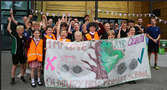
The Running Out of Time Climate Relay made a stop at the University