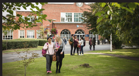
Worcester is ranked 1st for both graduate employment and quality education