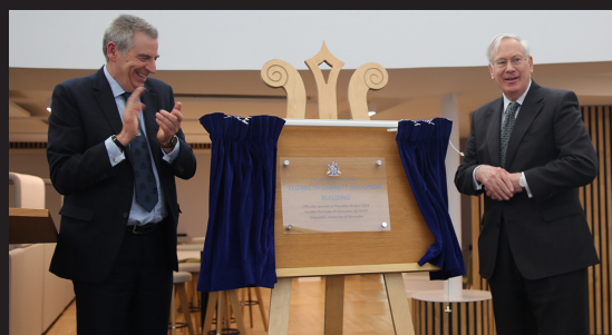
The University's Chancellor, HRH the Duke of Gloucester, performed the official opening of the EGA building