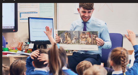
The University's Primary and Secondary teacher training was rated 'Outstanding' by Ofsted

The 2023/24 academic year started with the welcoming of the University's first ever cohort of Medical students. Following a long campaign over several years, a total of 44 students began their 4-year programme in the autumn of 2023 – a combination of 20 UK students, funded through generous donations from the Kildare Trust and local NHS partners, and 24 self-funded international students.