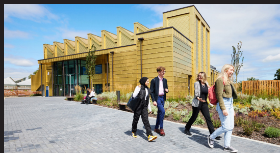
The Elizabeth Garrett Anderson (EGA) building for health and medical education opened in 2024